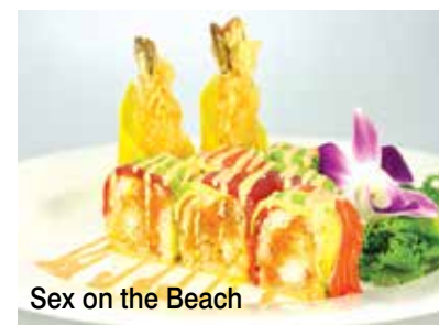
Sex on the Beach