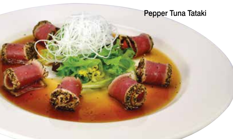
Pepper Tuna Tataki