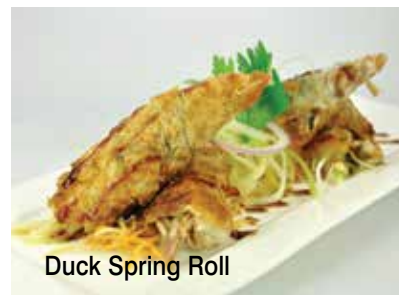
Duck Spring Roll

* Consuming raw or undercooked meats, poultry, seafood, shellfish, or egg may increase your risk of foodborne illness, especially if you have certain medical conditions