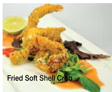
Fried Soft Shell Crab