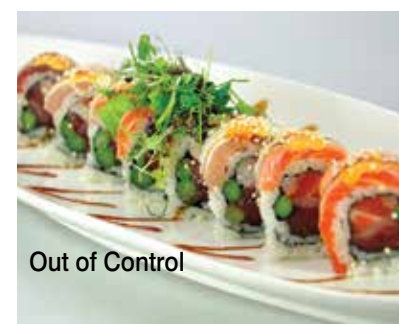
Out of Control