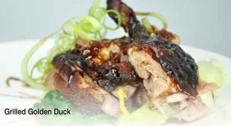
Grilled Golden Duck